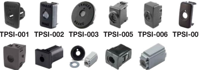
TPSI-001 TPSI-002 TPSI-003 TPSI-005 TPSI-006 TPSI-007 TPSI-008 TPSI-009 TPSI-010 TPSI-011 TPSI-012

A Tow-Pro Elite Switch Insert aids in the installation of the remote head into vehicles. It allows the installer to create an OE-looking remote head mount whilst still maintaining ADR21 compliance (when correctly fitted). REDARC also offer Tow-Pro Switch Inserts in bulk packs of ten.